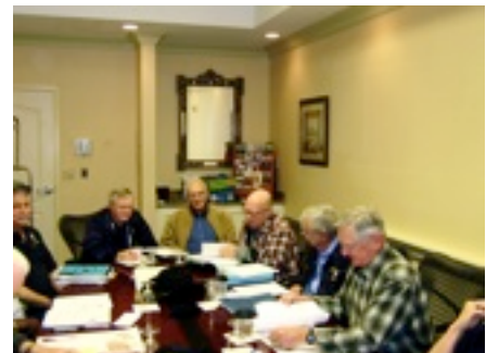
Your Board Hard at Work or Hardly Working??