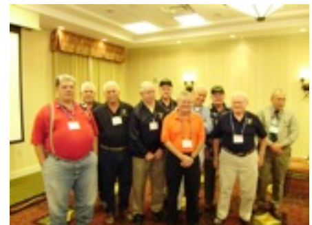
A Mix of 2010 and 2011 Board Members