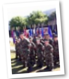
Future NMCB 14 Seabees