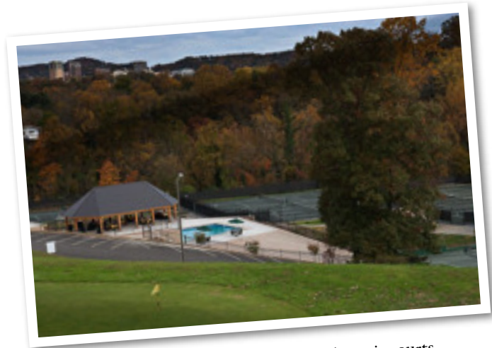
Crowne Plaza Hotel outdoor pool and tennis courts