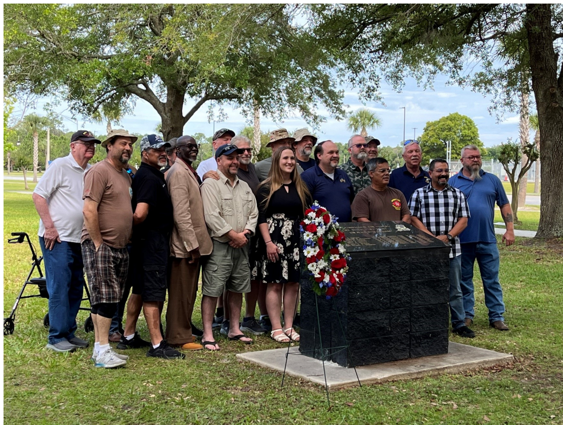
Family and Shipmates of KIA during Operation Iraqi Freedom meet at the memorial at NAS Jacksonville on 04 MAY 2024.